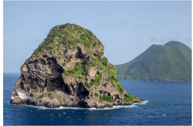
PLATE 2 Diamond Rock.