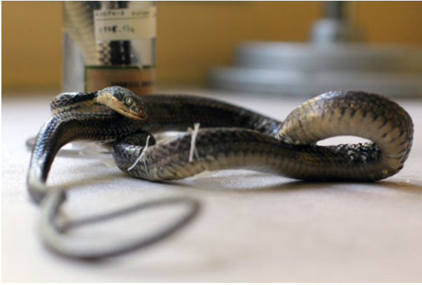
PLATE 1 Museum specimen (MNHM 1887.0120) of the dipsadid racer Erythrolamprus cursor, endemic to Martinique.